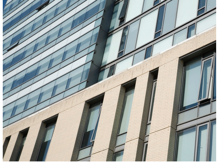
Woodsworth College Residence University of Toronto, Toronto, Ontario

Head and sill members run between the coupling mullions for easy assembly of the 516 Thermal Window as a series of modular units. Glazing can be installed and replaced from the interior to reduce costs and weather delays. 516/518 Thermal Windows accommodate 1" (25.4 mm) sealed glazing units and have lock-in glass stops. Pre-shim butyl glazing tapes are used on the exterior, and EPDM rubber glazing gaskets are used on the interior.